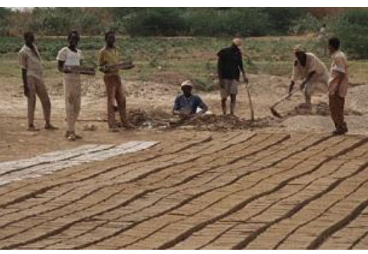
Figure 2: Slop-moulding and drying of bricks.

Cow-dung improves the plasticity of clays and acts as reinforcing agent reducing concentrated cracks that can lead to breakage within the raw bricks. Upon firing the dung fibres ignite, thus assisting in even .firing of bricks and minimizing the development of high temperature gradients within the brick - a phenomenon which may lead to firing cracks. When the fibres burn out they leave cavities within the brick which reduce unit weight and improve thermal characteristics. Cavities on top and bottom surfaces of the bricks increase the bond when bricks are laid in a mortar bed.