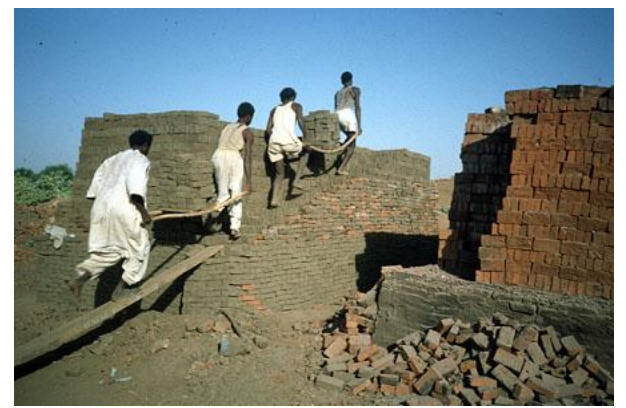
Figure 3: Staking of bricks for clamp-firing.

and enough water was added to give a workable plasticity. Each sample set consisted of 50 bricks, half of them slopmoulded in a double metal mould, and the other half sand-moulded in a single compartment wooden mould. Both moulds have the same dimensions (23 x11 x 7 cm). All samples were-sun dried (8) for three weeks, and fired in a clamp kiln for four consecutive days<sup>(9)</sup>. Capacity of the kiln was completed to 14000<sup>(10)</sup> bricks by loading 20 - 30% "normal" bricks together with the samples. After firing, 4 individual bricks from each sample set were packed and sent for testing strength, water absorption and density. Green and fired dimensions were also determined. Table (3) shows the experimental results for the slop and sandmoulded samples with the same dung content.